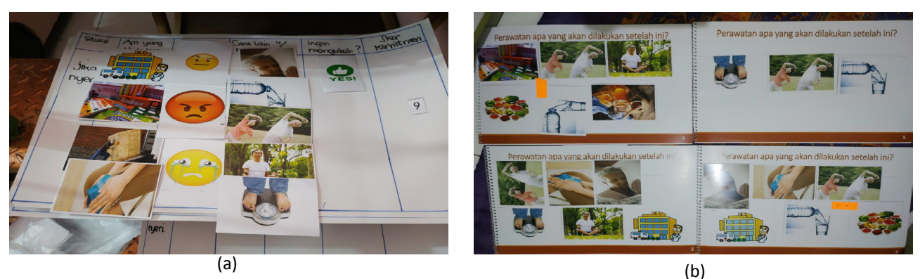
Figure 1. (a) Elderly's skill to identify the health problem with picture card in the psychoeducation session; and (b) Cognitive restructuring with picture card to assign the elderly commitment into adaptive behavior.