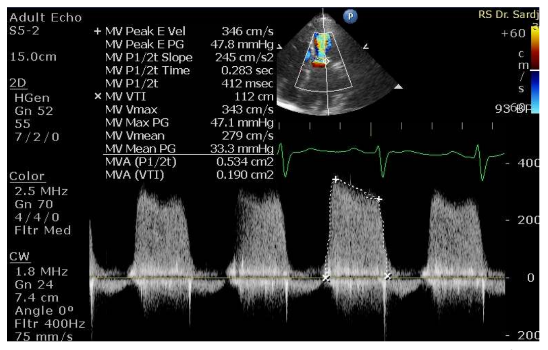
Figure 2. Transthoracic Echocardiography showed Severe Mitral Stenosis with MVA 0.53 cm<sup>2</sup> and Mitral Valve Gradient (MVG) 33 mmHg.