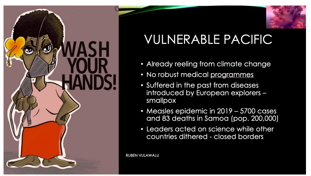
Figure 2. The vulnerable Pacific ... climate change still the existential threat.