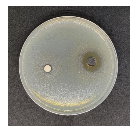
Figure 2. Antibacterial activity of liquid smoke

ANOVA statistical test results were showed a real difference between the sample groups. Inhibitory zones of liquid smoke of rice husk on MHA media with total inoculation of bacteria originating from broiler chicken coops can be seen in Figure 2. In general, it shows that liquid smoke of rice husk has the antibacterial ability and has the potential to develop be a natural disinfectant.