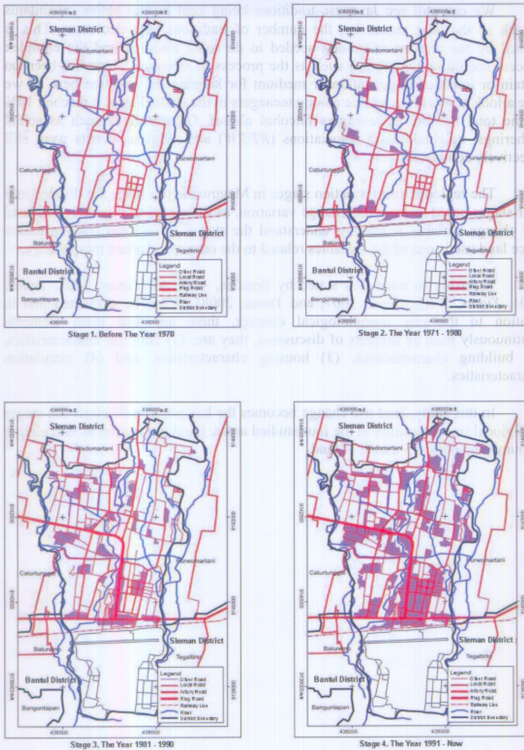
Figure 1. Regional Transformation Stages in Maguwoharjo Village