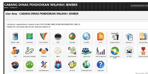
Figure 2. E-master application menu after updating

The E-Master application plays a crucial role in personnel management by positively influencing employees' personalities, regardless of individual differences. Its advantages include systematic data storage, reduction of work negligence, and providing a platform for feedback and suggestions, which also strengthens relationships among employees. Employee data is uploaded through the master data menu, and human resource development can be monitored through the SKP menu, which includes attendance history, disciplinary records, and certificates for serious violations. The application also offers relevant personalized feedback for individual development, as evidenced by the monthly SKP assessments.