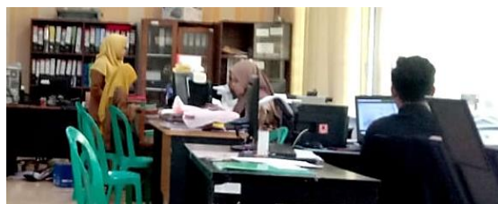
Figure 3. Interaction between employees

The E-Master application plays a crucial role in personnel management by positively influencing employees' personalities, regardless of individual differences. Its advantages include systematic data storage, reduction of work negligence, and providing a platform for feedback and suggestions, which also strengthens relationships among employees. Employee data is uploaded through the master data menu, and human resource development can be monitored through the SKP menu, which includes attendance history, disciplinary records, and certificates for serious violations. The application also offers relevant personalized feedback for individual development, as evidenced by the monthly SKP assessments.