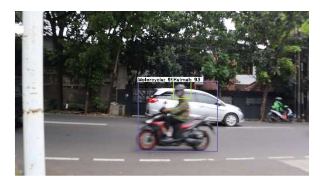
Figure 4 Prediction from custom dataset (Helmet)