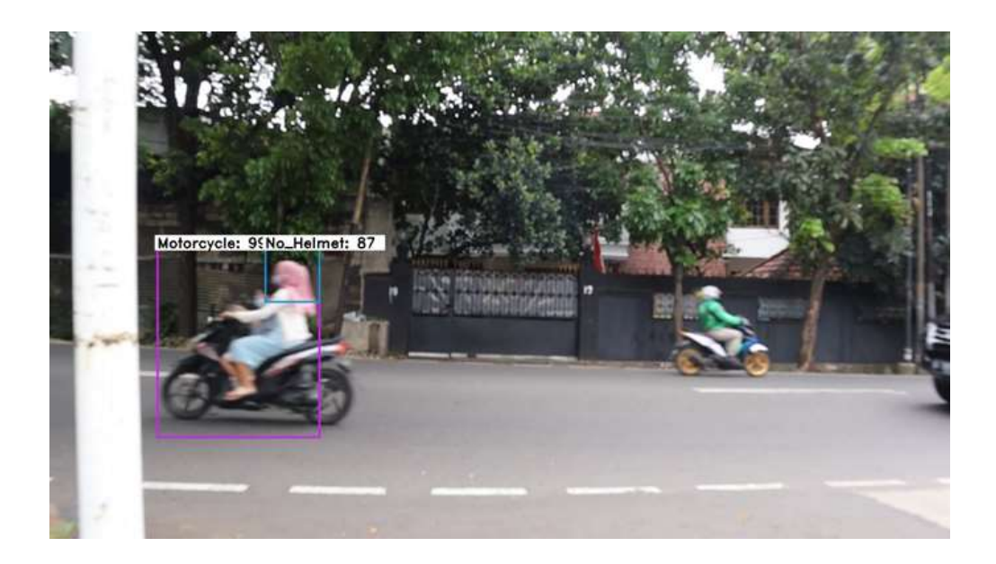
Figure 3 Prediction from custom dataset (No helmet)

The Figures 3, 4, and 5 are the predictions made from the Faster – RCNN model. The model successfully predicts the motorcycles, helmets, and non - helmets in its right location, but there are some predictions that did not predicted the objects. To cover that, though originally planned to train with 300 epochs only, the epochs were increased so that the false positives, false negatives, and true negatives were reduced.