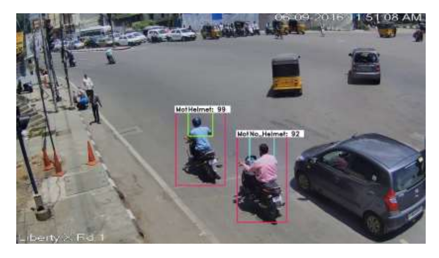
Figure 5 Prediction from IITH dataset