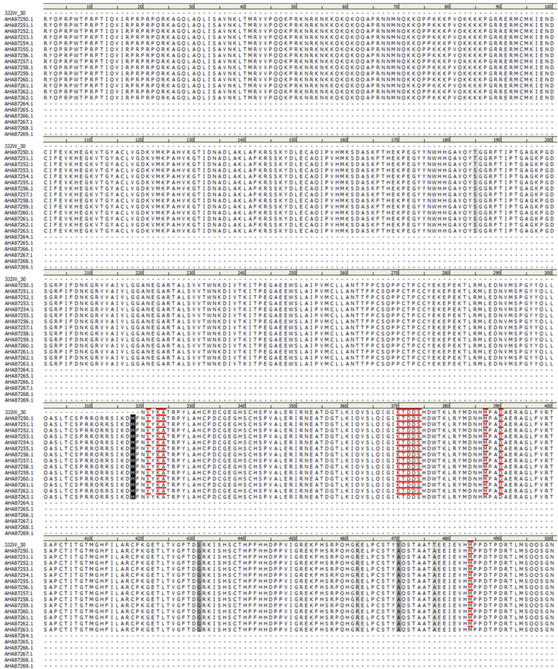
Fig S1. Sequence alignment of E1-E2 Ind-CHIKV. The mutation points are highlighted in dark color. The CHK-152 antibody binding site are presented in red line and the B-cell epitopes are highlighted in black and blue color, respectively

This supplementary data is a part of a paper entitled “Protein Modelling Insight to the Poor Sensitivity of Chikungunya Diagnostics on Indonesia’s Chikungunya Virus”.