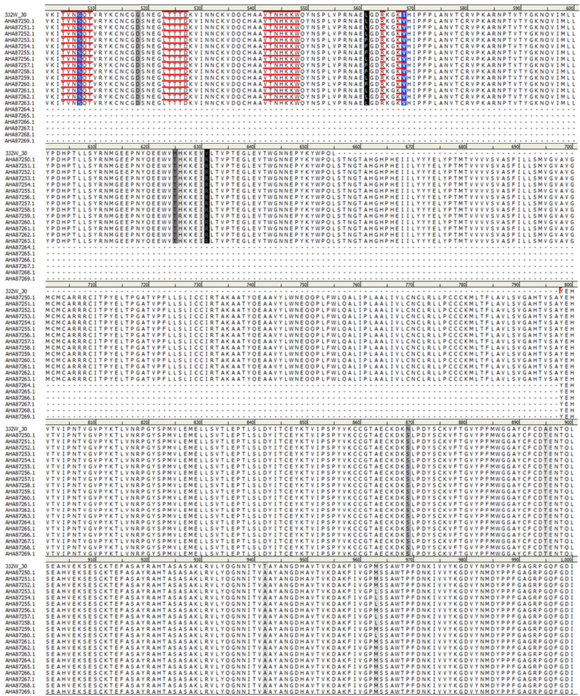
Fig S1. Sequence alignment of E1-E2 Ind-CHIKV. The mutation points are highlighted in dark color. The CHK-152 antibody binding site are presented in red line and the B-cell epitopes are highlighted in black and blue color, respectively (Continued)