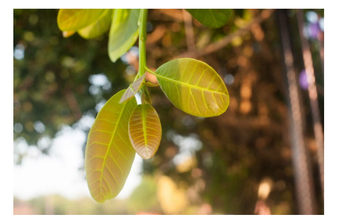
Fig 1. Young leaves of A. occidentale L.

In nature, the insoluble-bound phenolics are one of the components of cell walls, while soluble ester phenolics compartmentalized within the plant cell vacuoles [21]. Therefore, the yield of extraction depended on the polarity of the compound to the solvent and method of extraction [22]. In this study, the soluble ester and insoluble-bound phenolic fractions were undergone extraction with acid-alkali treatments to release them from the bonded form. Here, we compared the enzyme-inhibitory activities of the extracts between free, soluble esters, and insoluble-bound phenolic fractions, as well as between the young and mature leaves. It is anticipated that these findings could provide some possible mechanisms by which they are used in the management and prevention of type 2 diabetes mellitus.