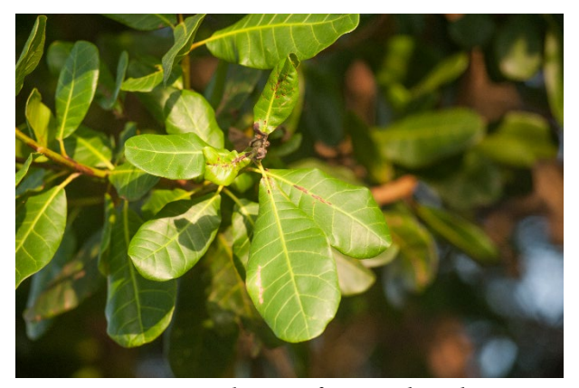
Fig 2. Mature leaves of A. occidentale L.