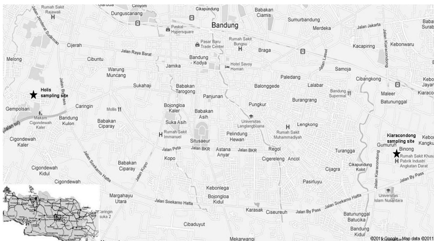
Fig 1. Sampling sites of semi industrial area Kiaracondong and Holis, Bandung

investigate the spatial and temporal patterns of transport and deposition of particular air pollutants to the Indonesian environment. Some publications related to air pollution level in urban Bandung and suburban Lembang have been published. Santoso et al. [5] reported on the composition and source apportionment of fine and coarse particle samples collected in Bandung and Lembang, Indonesia between 2002 and 2004. The mean values of PM_{2.5} concentrations in Bandung and Lembang were 14.03 \pm 6.86 and 11.88 \pm 6.60 \mu g m^{-3} , respectively. The mean values of PM_{10-2.5} concentrations in Bandung and Lembang were 17.64 \pm 9.42 and 7.10 \pm 7.04 \mu g m^{-3} , respectively. Only limited publications of air pollution in Indonesia are available, and the data of air quality in industrial area are still limited. Industrial emissions are believed to be one of major contributor to particulate matter, therefore this study will assess the PM_{2.5} and PM_{10} level in industrial areas particularly in Bandung. Besides that, the objective of this research is also as a pre-study to identify the sources that could contribute to the particulate mass especially from industrial emissions in the areas.