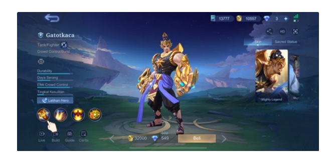
Figure 5. The character visuals of Gatotkaca from "Mobile Legend: Bang Bang"

id animations, contributing to its immersive environment. Furthermore, its gameplay is characterized by rapid and addictive 5v5 battles across various game modes, each character fulfilling distinct roles with accompanying strengths and weaknesses. Overall, while narrative depth may not be the game's forte, its allure lies in its highly addictive gameplay, facilitating engaging player-versus-player encounters and fostering an enjoyable gaming experience.