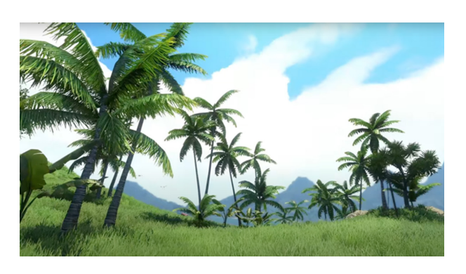
Figure 4. The environmental visuals from "Far Cry 3"