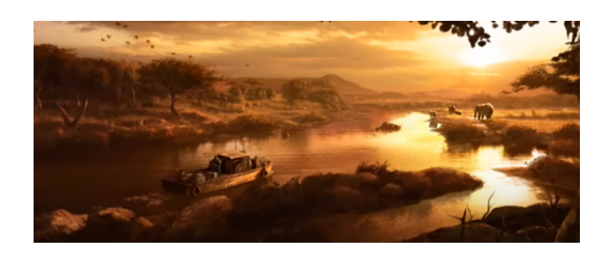
Figure 3. The environmental visuals from "Far Cry 2"

the story of a player who assumes the role of a mercenary tasked with killing an arms dealer known as "The Jackal," while also becoming involved in the country's civil war. In terms of visuals, the game features detailed and authentic environments with dynamic weather effects and a day-night cycle, allowing players to experience a beautiful yet chaotic country due to ongoing conflict. Regarding gameplay, the game emphasizes an open-world mechanism that enables players to freely explore, complete missions, and employ various strategies and weapons, which can realistically degrade over time. The game employs a branching narrative structure, allowing player decisions to impact the storyline and relationships with other characters, thereby creating a unique experience with each playthrough.