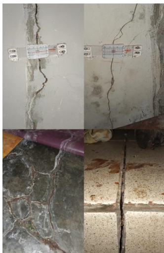
Figure 2: The effects of tunnel blast on residents' houses in Kompleks Tipar Silih Asih

"Houses can collapse at any time" (Interview, Akbar, 2021).