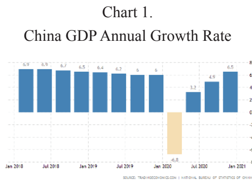
Figure 2.2. China's GDP Annual Growth Rate from 2018-2021 (Trading Economics, n.d.)