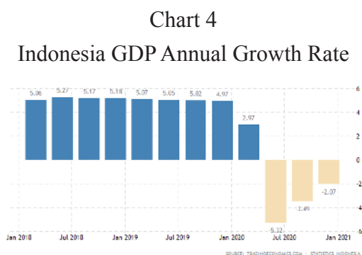
Figure 5.5. Indonesia's GDP Annual Growth Rate from 2018-2021 (Trading Economics, n.d.)