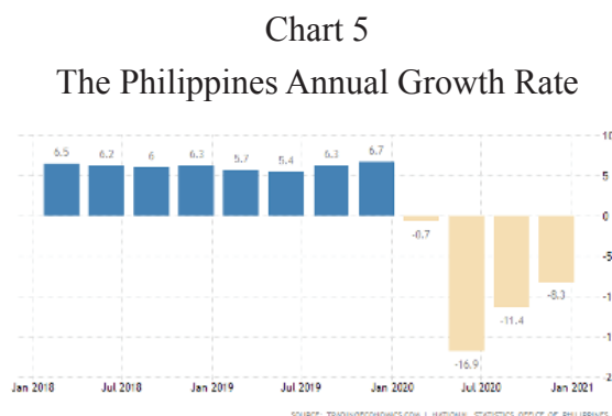
Figure 6.6. Philippines' GDP Annual Growth Rate from 2018-2021 (Trading Economics, n.d.)