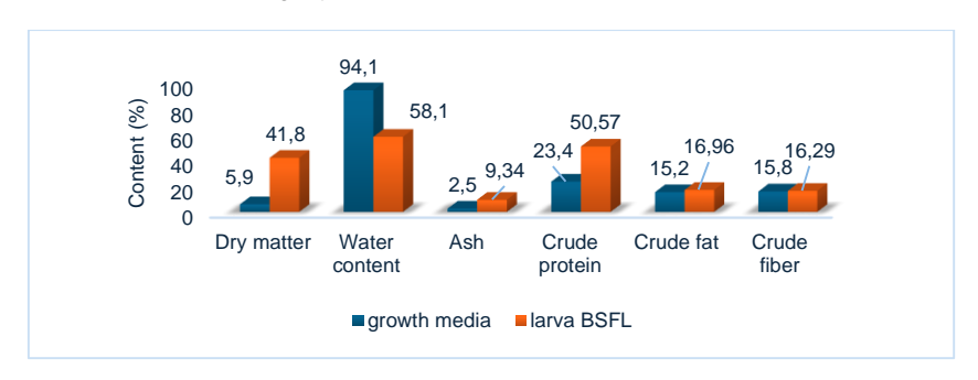
Figure 1. Nutrient content conversion rate of tofu waste to BSFL.

The protein conversion rate (g protein required to produce 100 g of body weight) of BSFL reported to be 24.6% and takes only 21 d (Seyedalmoosavi et al., 2022). The bioconversion ability of BSFL is also influenced by the ability to digest various kinds of media used. This is related to enzymes in the salivary gland and digestive tract where the main enzymes are amylase, protease (Seyedalmoosavi et al., 2022), and lipase, but the interaction between digestive tract microbes also helps digest nutrient components that cannot be digested directly by BSFL, especially fiber digestion and provides nutrients such as vitamins, increases immune response, and as a competitor of pathogenic microbes, hormonal system and also behaviour (Zheng et al., 2017; Kim et al., 2011). Jeon et al. (2011) reported that the results of pyrosequencing analysis of the gastrointestinal microbiota of BSFL larvae can change and are influenced by the diet/substrate used. Moreover, polyphagous insects can synthesize a wide range of proteolytic enzymes for digesting the diverse proteins obtained from several (Seyedalmoosavi et al., 2022).