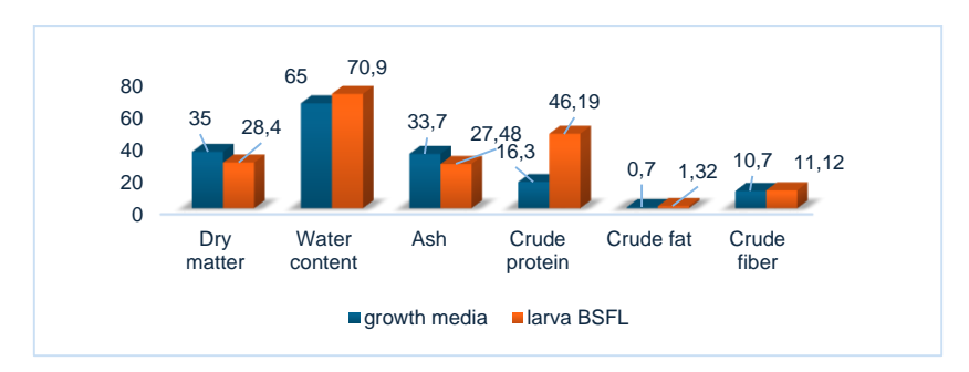
Figure 3. Nutrient content conversion rate of chicken manure to BSFL.