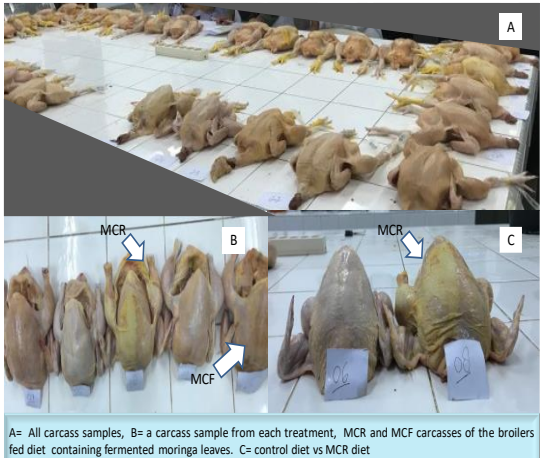
fed diet containing fermented moringa leaves. C= control diet vs MCR diet (doc. Zulfan et al. 2021)

absorption of carotene, the pigment abundantly existing within the moringa (Saini et al. , 2014). This result agreed with Ayssiwede et al. (2011) reported that the inclusion of moringa in the diet increased broiler carcass-skin coloration. The carcass-skin yellow colors among the treatments were given in Figure 1.