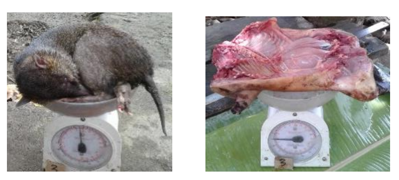
Figure 3. Body weight (a) and carcass weight (b) measurement.

without the furs, head, front and hind legs (on the carpal and tarsal parts), tails (on the sacrum part), blood, visceral and guts.