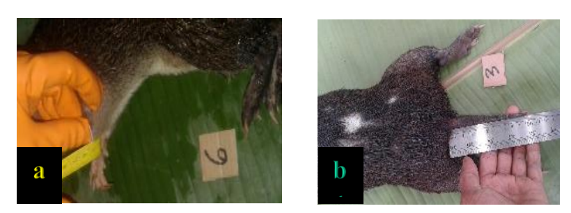
Figure 2. Cannon girth (a) and tail length (b) measurement.