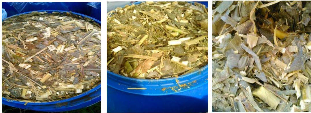
Table 1. Nutrient composition of corn silage

The high level of carbohydrates helps to ensure that abundance of lactic acid for preservation will be produced. If condition for chopping or storing the silage are not ideal, fermentation may be delayed, causing a loss of nutrient and bad silage quality. Inoculation of lactic acid bacteria to corn plant prior to ensiling was aimed to provide a good environment for lactic acid bacteria to do fermentation, enhanced the desirable microflora, decreased the growth of spoilage fungi or yeast in order to produce a good quality silage (Amado et al., 2012). Inoculum of lactic acid bacteria was originally used to reduce pH and to avoid the risk of clostridial fermentation by the native bacterial population (Wilkinson et al., 2003). L. plantarum has the potential to increase the production of lactic acid because it is belong to homofermentative