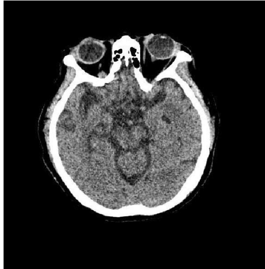
FIGURE 1. Multiple lacunar infarction on pons, thalamus, and posterior limb of internal capsule

A diagnosis of moderate COVID-19 with complication of embolic stroke and myocardial infarction was made, and IV furosemide 20 mg q.d. was administered for pulmonary edema. Recombinant tissue plasminogen activator (rTPA), a thrombolytic agent, is administered in doses of 40 mg, 10% as an initial IV bolus over one min and the remainder infused over 60 min. Citicoline is given intravenously in doses of 250 mg twice daily as a neuroprotectant to stabilize membrane permeability. Hypertension was managed with oral carvedilol 6.25 mg b.i.d., and oral ramipril 5 mg q.d., targeting 160/90 mmHg on 6 h. IV ciprofloxacin 400 mg b.i.d., IV vitamin D 2000 IU q.d., IV paracetamol 500 mg q.i.d., oral favipiravir 600 mg b.i.d., and oral ambroxol 30 mg t.i.d. were administered following the Indonesian recommendation for COVID-19 infection. Evaluation PCR test on day 8 and 9 of treatment showed negative COVID-19 results, and she was discharged from isolation room. She then moved to non-infection ward for further evaluation. After 11 d of treatment, she showed improvement of left extremities