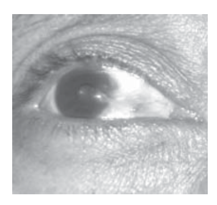
FIGURE 3. Pterygium recurrence in triamcinolon acetonide group after 3 month follow up.