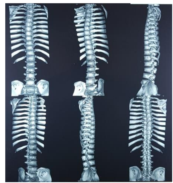
Figure 3. Whole spine CT-Scan showing thoracal scoliosis with wedge fracture at L2 level