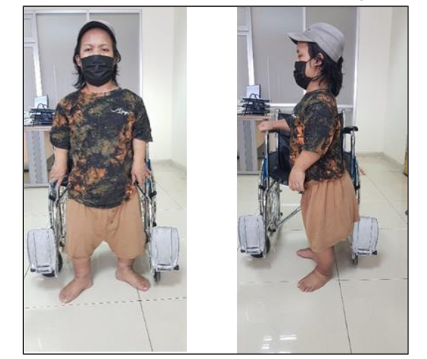
Figure 1. Preoperative image of 23-year-old man with large head, prominent forehead, short arms and legs with long trunk

part of the legs (below knee) and medial side of his toes, also loss of motoric function on both of his legs. He has history of hydrocephalus and underwent surgery when he was a kid.