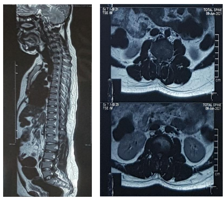
Figure 4. Whole Spine Sagittal View and Axial MRI showing stenosis in several level of lumbar spine and ossification of ligamentum flavum

At first, he admitted to the Public Hospital at his home town Tanjung Pinang, Riau accompanied by his family. He did consume