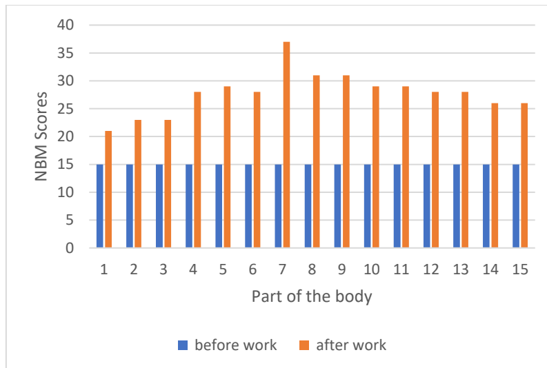
Figure 4. Discomfort Scores Before (blue) and After Work (red)

The Nordic Body Map (NBM) is a questionnaire filled out by workers to assess muscle pain experienced while working (Wilson and Corlett, 1995). Fifteen worker limbs were self-assessed by assigning a score of 1 for limbs that felt no pain, a score of 2 for slight pain, a score of 3 for pain and a score of 4 for very high pain. The questionnaire is filled out before and after palletizing. All workers do not feel any pain before work. Figure 4 shows the number of scores for each limb for 18 workers. The highest score indicates the limb feels the most pain for all workers. The three highest scores were leg numbers 7,8,9 which means that the lower back is the most followed by pain in the left hand and right hand.