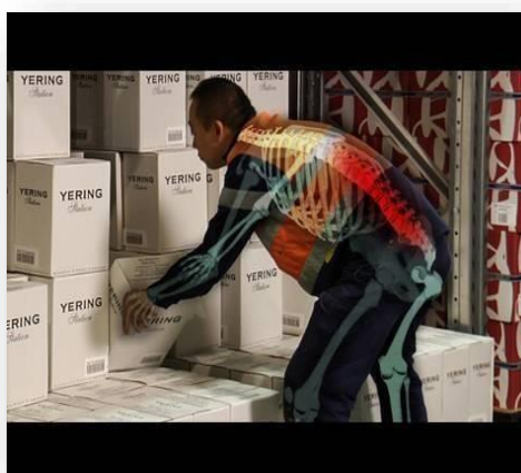
Figure 3. Illustration of the arrangement of cabinets on pallets

Using the RWL and LI formulas in equations 1 and 2, the original RWL obtained is 2.8 kg and the destination RWL obtained is 2.7. The original RWL value of 2.8 kg indicates that the recommended load weight for workers working between 2-8 hours a day, moving cabinets without handles at a height of 90 cm with a lifting frequency of 5 cabinets/min is 2.8 kg. Given that the actual weight of the moved cabinet is 18 kg, the Lifting Index value is 6.4. This value is very large compared to the value of secure LI 1. The higher the LI value, the greater the risk by workers (Waters et al., 1993).