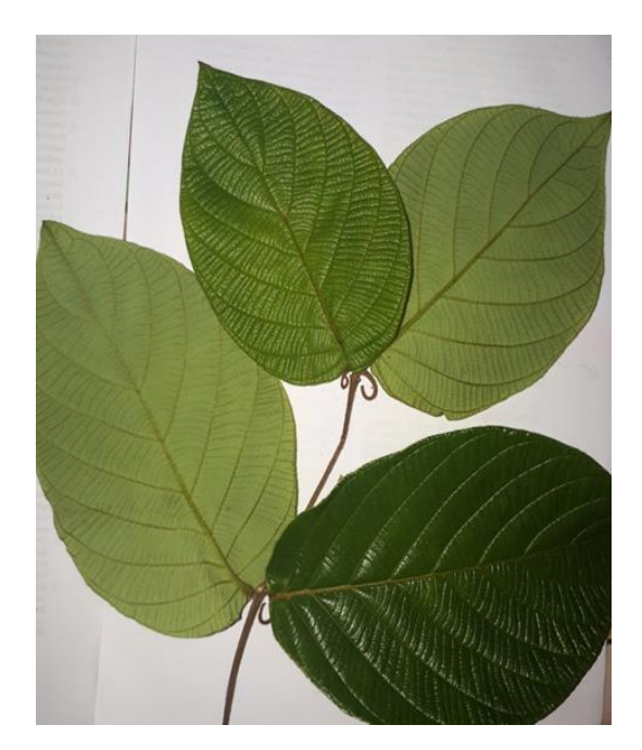
Figure 1. leaves of Kaik-kaik Root plants

and day 36 (T29) after treatment. Contain a brief but sufficiently complete description of procedures and materials to allow the experiment to be repeated. Only new procedures should be described. Previously published procedures should be referenced. Significance materials should be described in detail.