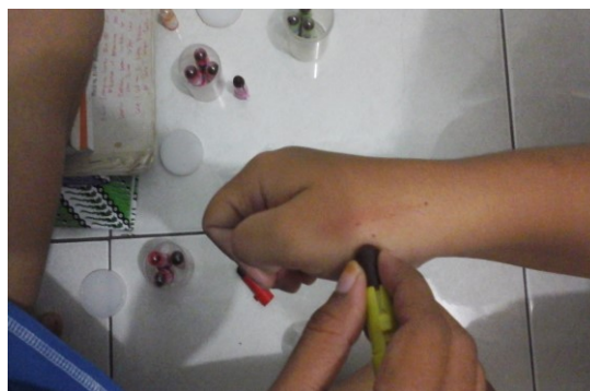
Figure 2. Smear test