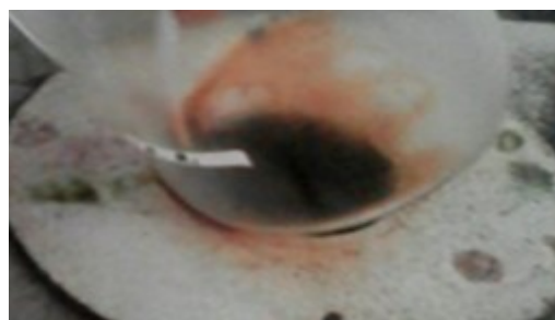
Figure 1. Results from extraction with solvent of 96% ethanol

Based on the results of this study it was found that the extract using 96% ethanol produced a brown color. However, the color produced from this study is less obvious because the solvent used to extract the anthocyanin is 96% ethanol and not acidified with HCl. Ethanol 96% has alkaline properties. According to Hambali et al (2014), temperature and pH influence the efficiency of anthocyanin extraction and the diffusion coefficient, the lower the pH the higher the diffusion coefficient, so the outward color will be more clearly visible (Figure 1).